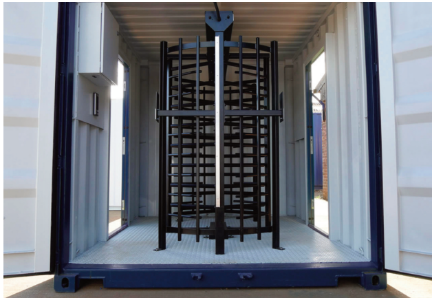
Double turnstile interior