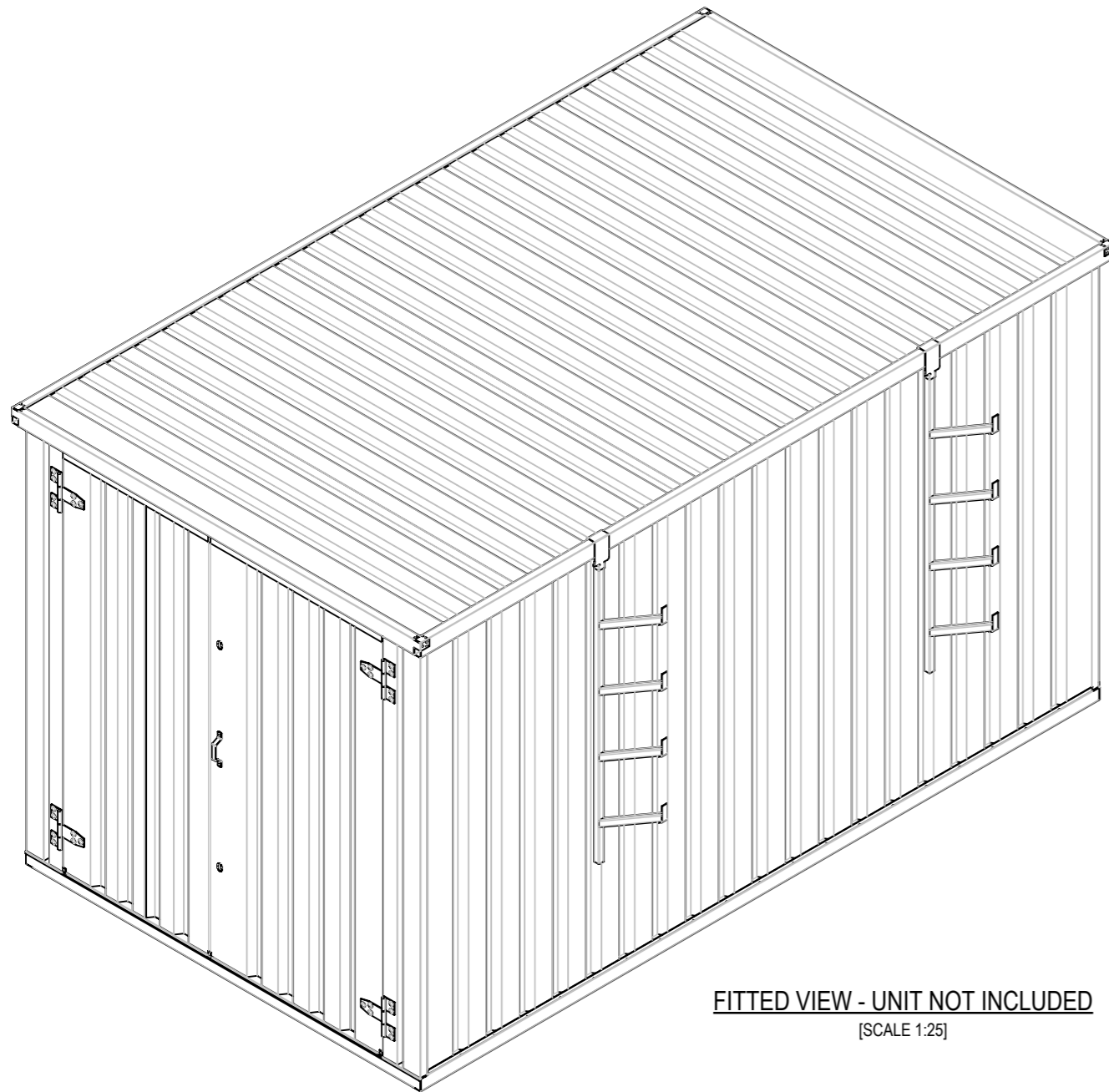
FITTED VIEW - UNIT NOT INCLUDED [SCALE 1:25]